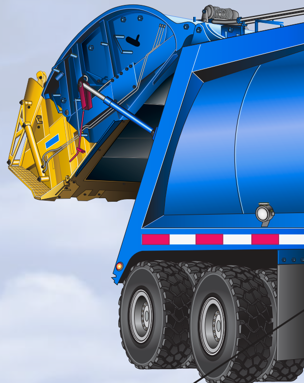
Hydraulic Reservoir Breather